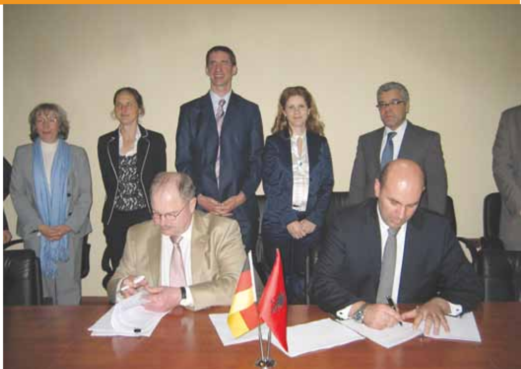
Photo: Albania and Germany sign the protocol of co-operation 2010-2011