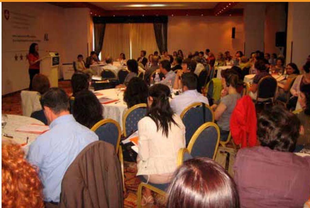
Photo: Workshop for sharing good practices in gender equality mainstreaming, organised by Swiss Co-operation Office in Tirana on 26 May 2010

framework and good potentials – so let us be practical and modest, just do it!". The theme of gender equality mainstreaming will continue to be of high priority in SCO-A's work in the next four years.