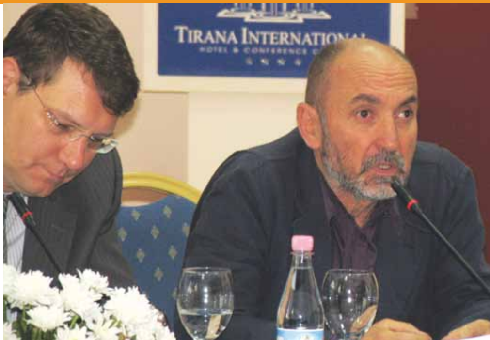
Photo: Roundtable conference organized by the OSCE Presence in Albania to mark World Press Freedom Day on 3 May

In May, experts from agriculture technology transfer centres (TTCs), researchers, productivity specialists and representatives of private farmers/producers associations met in Fushe Kruja to discuss ways of helping Albanian products and farmers to become more competitive. The aim was to discuss the role that research and extension services could play to make the sector more dynamic and competitive and called on TTCs and the Agriculture University of Tirana