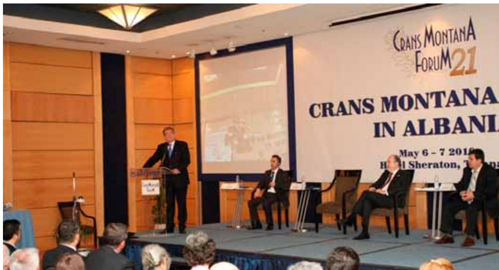
Photo: The 6th Crans Montana Forum, held on 6-7 May 2010

of Albania and Croatia in the Western Balkans; the impact of the crisis on South-Eastern Europe; the new and performing investment climate, and investment opportunities through privatization and the major Government priorities to attract long-term investments. The forum was opened by Prime Minister Sali Berisha who said that Albania will avert an economic crisis because of low fiscal burden on the business; the downsizing public sector which is no longer a burden on the taxpayers; and strategic investments in infrastructure. Energy, roads, minerals and tourism were some of the areas of interest for foreign companies participating at the event.