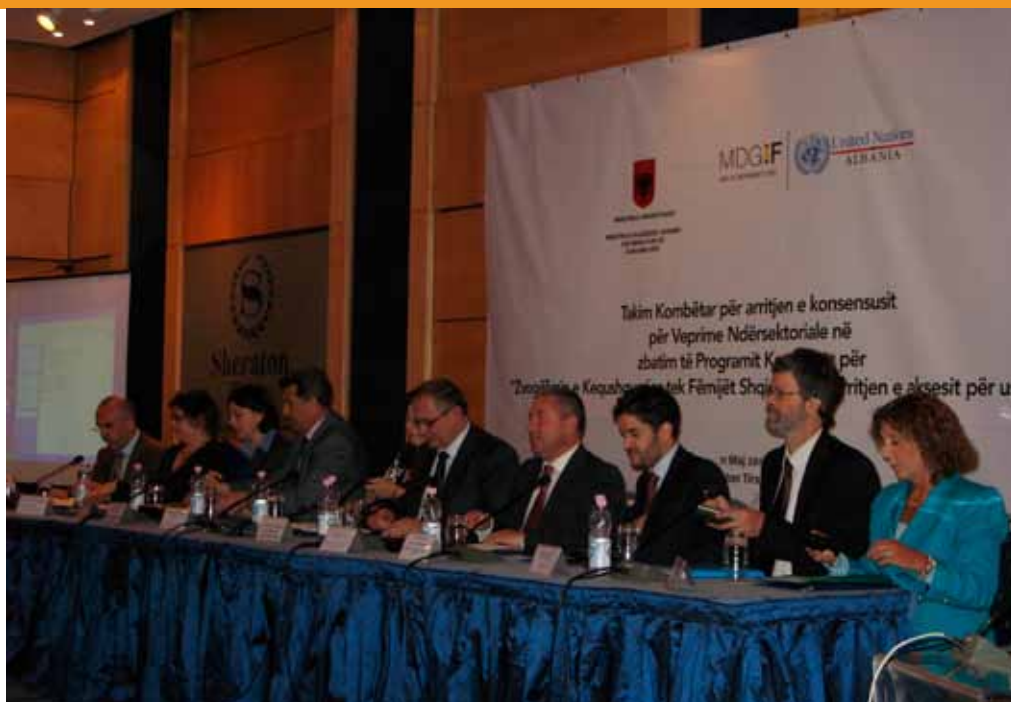
Photo: National partners commit to improve nutrition status of children and women in Albania

PAMECA has assisted with the development of the Inter-ministerial Operations Centre and on the 17 May, Prime Minister Berisha inaugurated the Centre. In the presence of the Ministers of Defence and Interior, Chiefs of Navy and Police and several other senior officials, he said that "it is important that the borders of free countries are no longer controlled by military forces and with the functioning of the Centre, we will ensure the civilian control of Albanian maritime space". He spoke of the positive results in the fight against illegal activities in the maritime space due to the Centre. He said that the Government had invested 2.4 million Lek for the radar system installed along the coastline. This system will support this Centre in its law enforcement and search and rescue activities. With this Centre, Albania has fulfilled one of the main conditions for visa liberalisation, he said. The Government will support this Centre by turning it into a positive example for the region. Due to strong co-operation with neighbouring countries and due to EU support, Albania will make the Adriatic Sea one