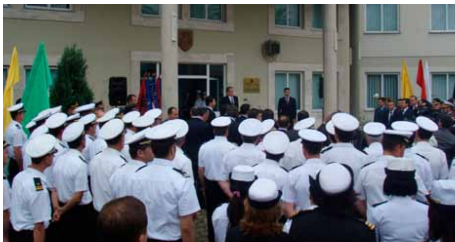
Photo: Inauguration of Inter-ministerial Operations Centre on 17 May 2010

Balkan countries outside Albania, chose Albania for this year's regional conference citing Albania as one of the few "growth markets" in Europe that uniquely avoided recession in 2009 with a GDP growth rate of 2.5%. Prime Minister Berisha urged participants to consider Albania's role in the EU economy. "Before you decide to go to China, investors would better think to come to Albania which in fact is not a 1 billion market but is a European market." The USAID co-sponsored the 4th Regional CEED Conference and B2B Meetings held on May 22 in Tirana along with several local businesses and organizations including Raiffeisen Bank, the Albanian American Enterprise Fund, the Kauffman Foundation, Small