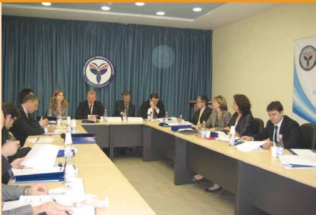
Photo: ICT Sector Working Group, organised on 17 May 2010

Participating donors were pleased to see more progress since last meeting and a better relationship with Government beneficiary institutions. In principle, donors agreed to an extension of IPS Multi-Donor Trust Fund until September 2011 but requested to see a detailed explanation for the extension, a revised procurement plan as well as an Implementation Action Plan from the government to serve as the government commitment that all activities under IPS Multi-Donor trust Fund will be completed by September 2011.