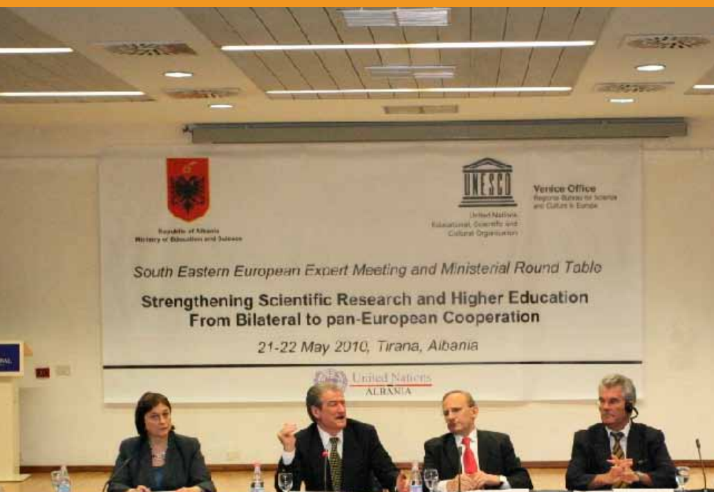
Photo: Conference Strengthening Scientific Research and Higher Education held on 21-22 May 2010

movement-wide mission statement. On the final day, participants attended thematic workshops on networking and problem solving session.