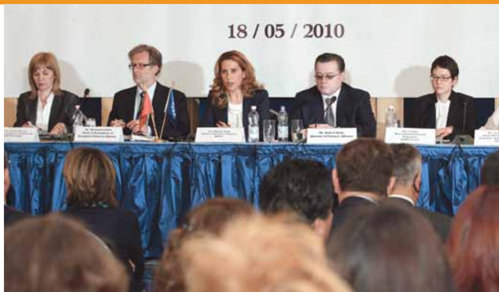
Photo: Regional conference on decentralized management of IPA funds, held in Tirana on 18 May 2010

On 4 May 2010, the Government and UNDP presented to stakeholders, the findings of a study of nine environmental 'hot spots' in Albania. This study was part of the UNDP project Identification and prioritization of environmental hotspots in Albania funded by the Dutch Government. It includes an assessment, remediation action plans and cost estimates for nine environmental hot spots in the: Berat Battery Factory, Perrenjas Mine Site, Buildings at Biticka Mine, Dajti Enterprise Site in Tirana, Tailing Dam in Guri i Kuq