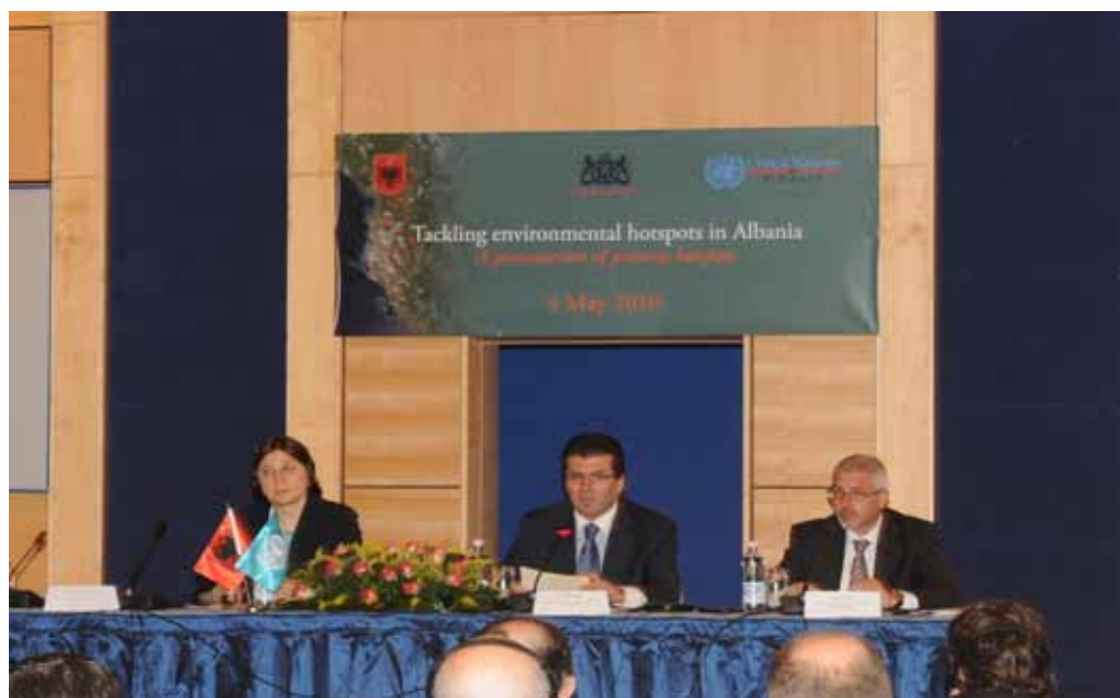
Photo: Donor's meeting Tackling Environmental Hot Spots, organised on 4 May 2010

capacity gaps." Minister of Environment, Forests and Water Administration, Fatmir Mediu, said "We should be aware that the cleaning of environmental hot spots is a challenge to be faced, which can not be successfully realized without the joint efforts of all stakeholders, and without nourishing the appreciation and interest for the environment, which should be considered as an added value for which we are responsible to protect and manage efficiently for the generations to come". The UNDP and the Government have already conducted the cleaning up of Bajza railway station, Balez chemicals depot and several satellite sites. Recently, interventions to reduce the risk associated to the tailing dams at Reps and Rreshen mines have started.