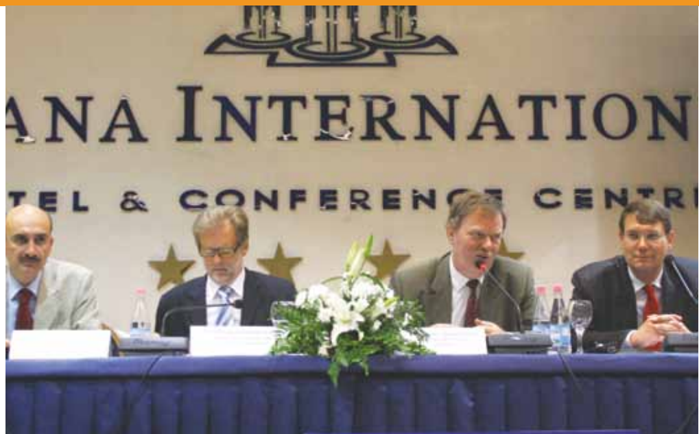
Photo: Quo Vadis civil society? Conference organized by OSCE Presence and EU Delegation on 25 May 2010

we are committees in creating bridges of cooperation and a healthy partnership with civil society.'