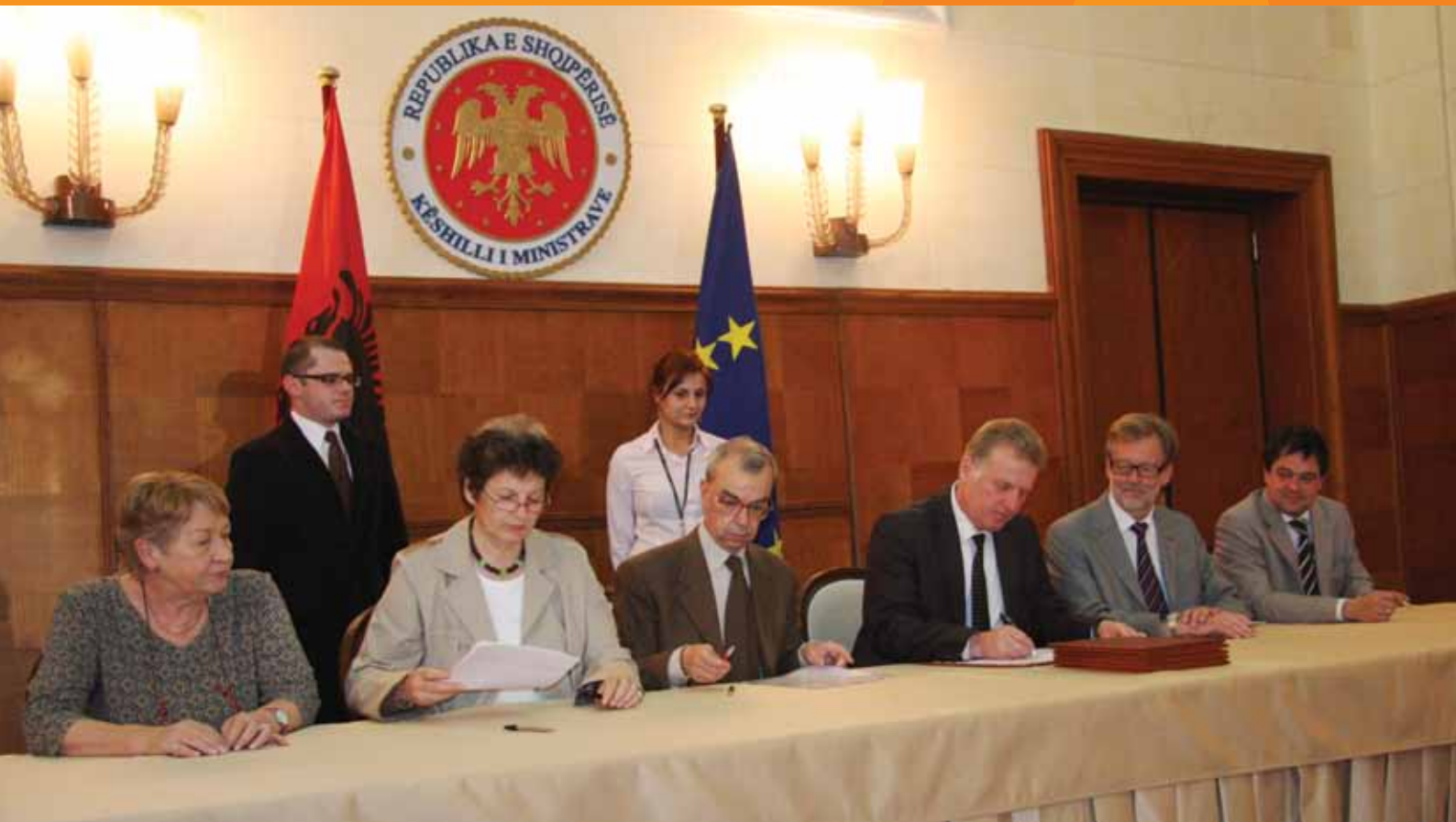
Photo: The ceremony of signing the Memorandum of Understanding on Fast tracking Initiative on Division of Labour, 31 May 2010