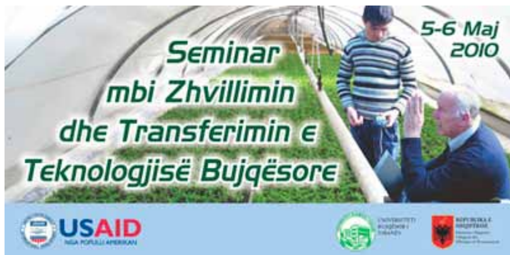
Seminar on linking research and extension services to farmers

one. The aims to bring the Authority and inspectorates out of their current arbitrariness. Prime Minister Sali Berisha attended the inauguration ceremony of the Authority along with the Minister of Agriculture, Food and Consumer Protection, Genc Ruli and the Head of the European Union Delegation to Albania, Ambassador Helmuth Lohan from, an institution that has heavily assisted the drafting of the legislation on functioning of this authority and up to refurbishing of the premises. Ambassador Lohan expressed his enthusiasm for the creation of such an important institution targeting to achieve the integration standards into the EU family.